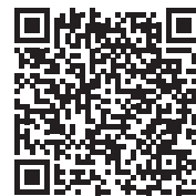
C2G26 After-Dark | Dinner & Laughs