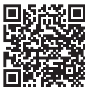
C2G26 Conference, Livestream